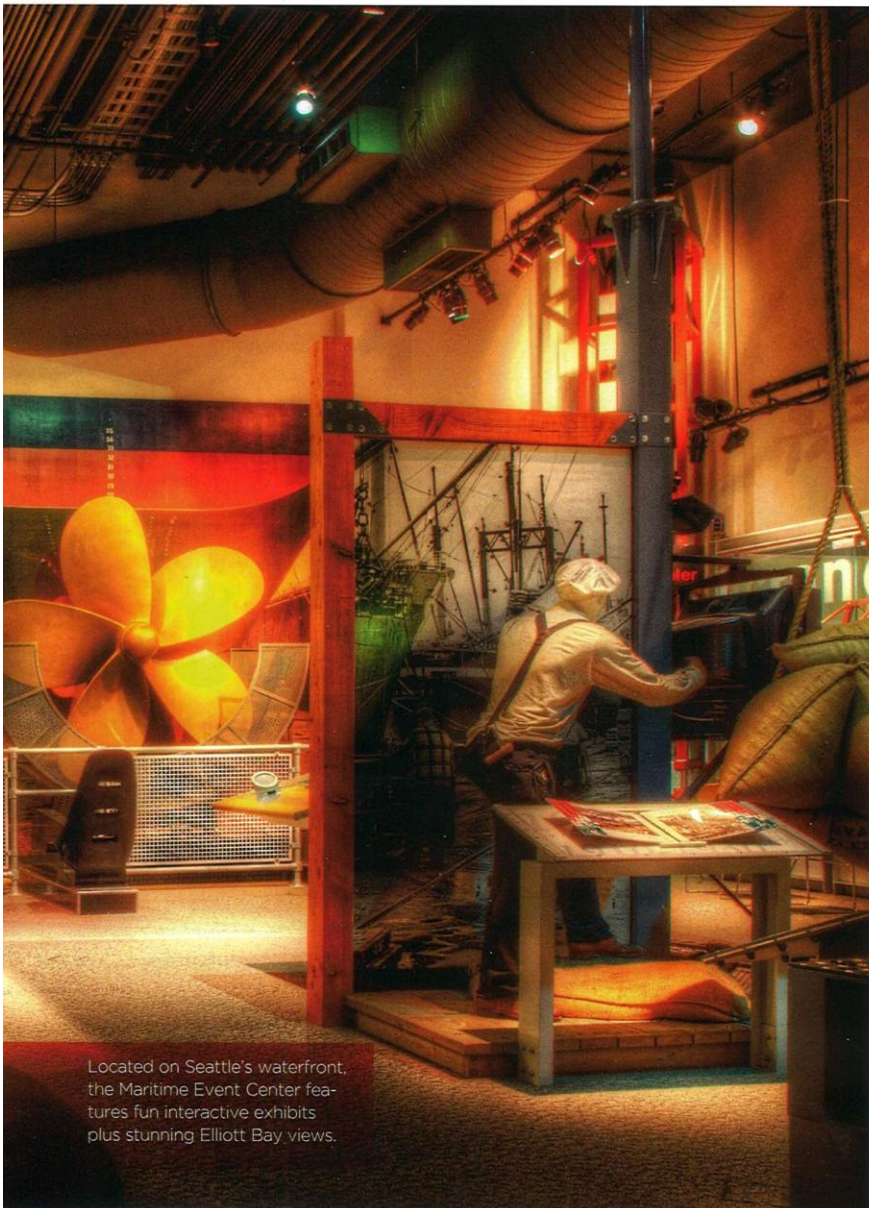
Located on Seattle's waterfront, the Maritime Event Center features fun interactive exhibits plus stunning Elliott Bay views.

In the shadow of Pike Place Market and downtown Seattle, framed by the Olympic and Cascade mountains, the Maritime Event Center communicates